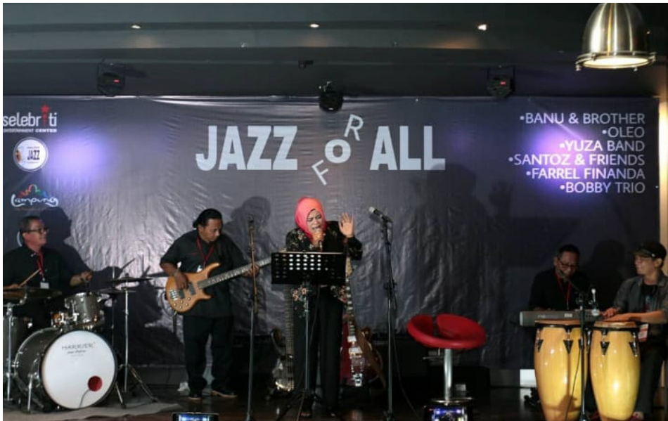
[Figure 2] The KJC held its regular community event on November 18, 2018, with the tagline "Jazz for all."