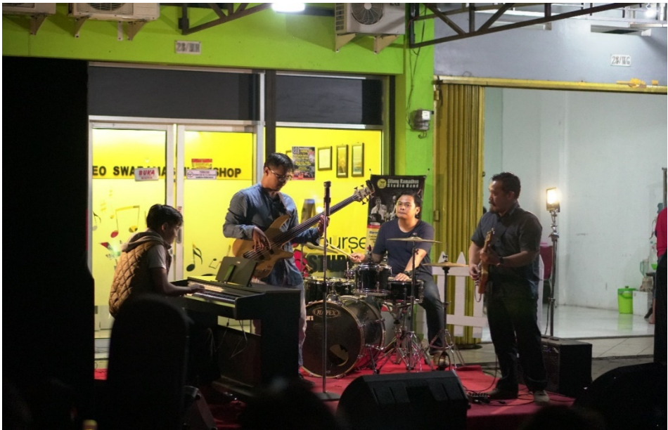
[Figure 1] A band performance on Jazz community regular event in 2017.